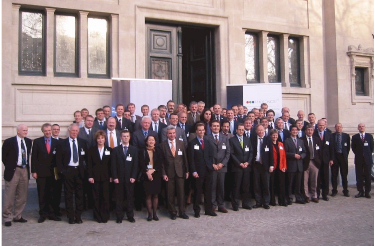
The Board of stakeholders in front of the Bibliothèque Solvay in Brussels with more than 20 EPIC Members among them