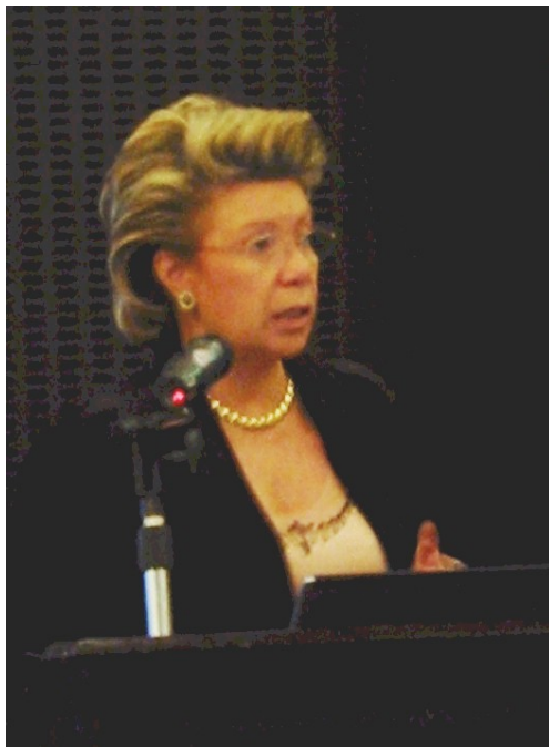
Commissioner Vivian Reding officially opened the workshop Photonics21 on the second day where participants laid the foundations for a common Strategic Research Agenda.